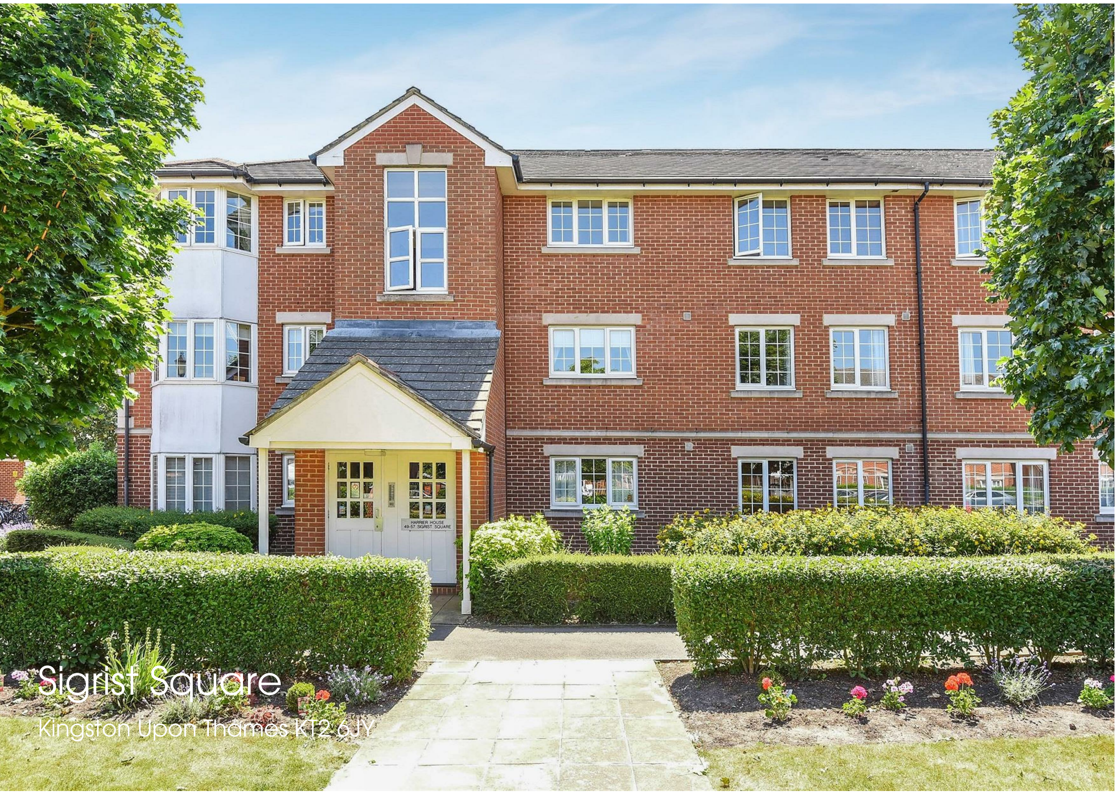
Sigrist Square Kingston Upon Thames KT2 6JY